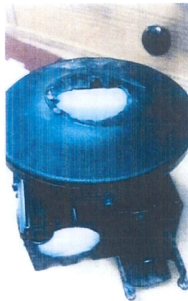
Examples of water meter lids and MXU's (Meter Radio Reader) in the lid.